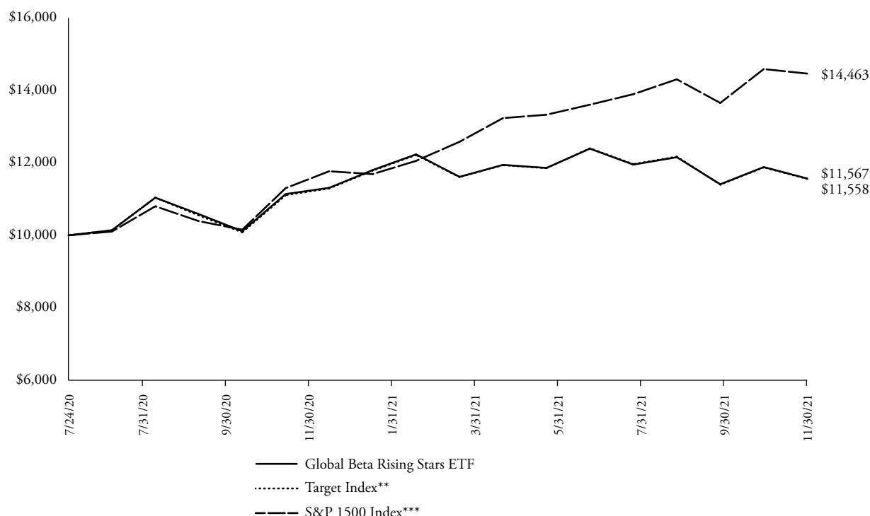
Growth of $10,000 Investment (At Net Asset Value)

Performance measured by NAV differs from the Target Index primarily due to Fund fees and expenses.