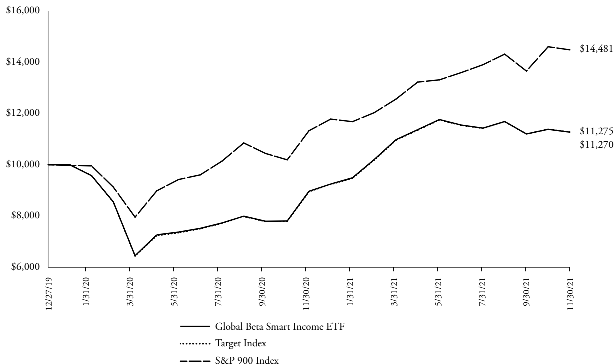
Growth of $10,000 Investment (At Net Asset Value)

Performance measured by NAV differs from the Target Index primarily due to Fund fees and expenses.